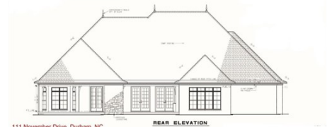
111 November Drive, Durham, NC